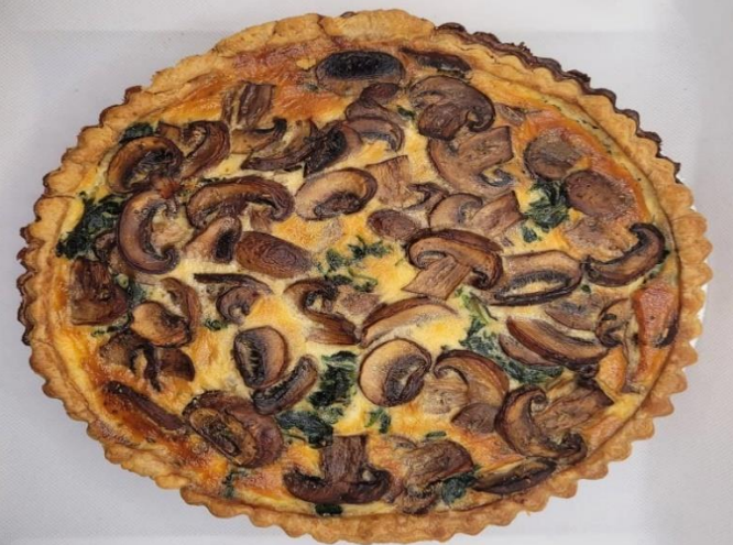
MUSHROOM/SPINACH/ PARMESAN FREEZABLE