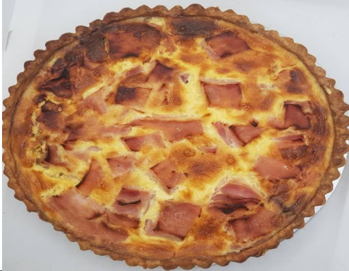
QUICHE LORRAINE FREEZABLE