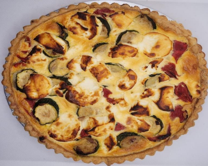
ROASTED RED PEPPERS/ COURGETTE/ GOAT CHEESE FREEZABLE