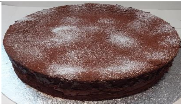
FLOURLESS CHOCOLATE MOUSSE CAKE FREEZABLE