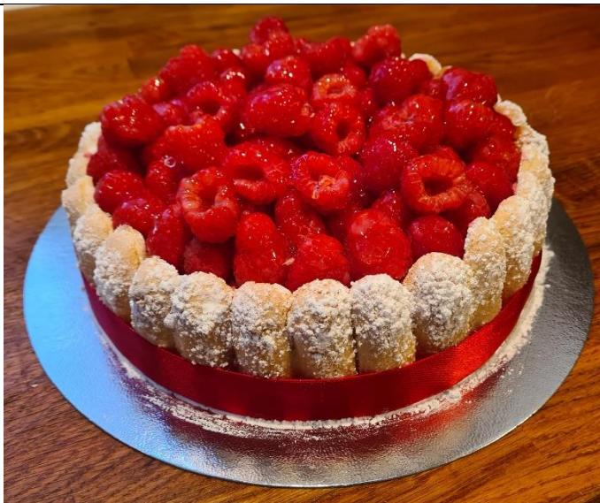
CHARLOTTE AUX FRAMBOISES FREEZABLE