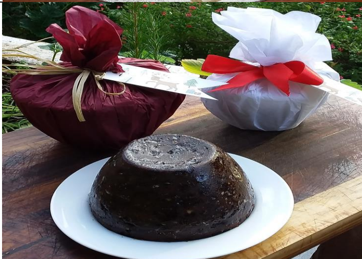
HOMEMADE CHRISTMAS PUDDING