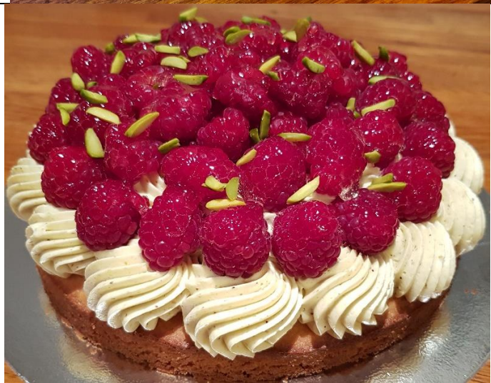
SABLÉ BRETON STRAWBERRY/RASPBERRY/ BOTH FREEZABLE