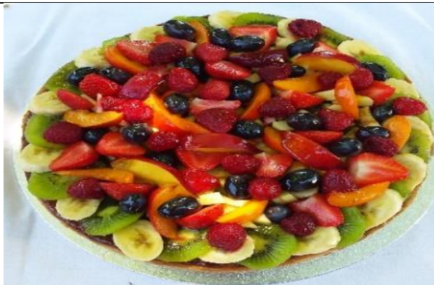
TARTELETTE AUX FRUITS FRAIS