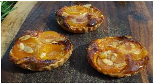
TARTELETTE ABRICOT FREEZABLE