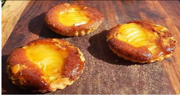
TARTELETTE POIRES FREEZABLE